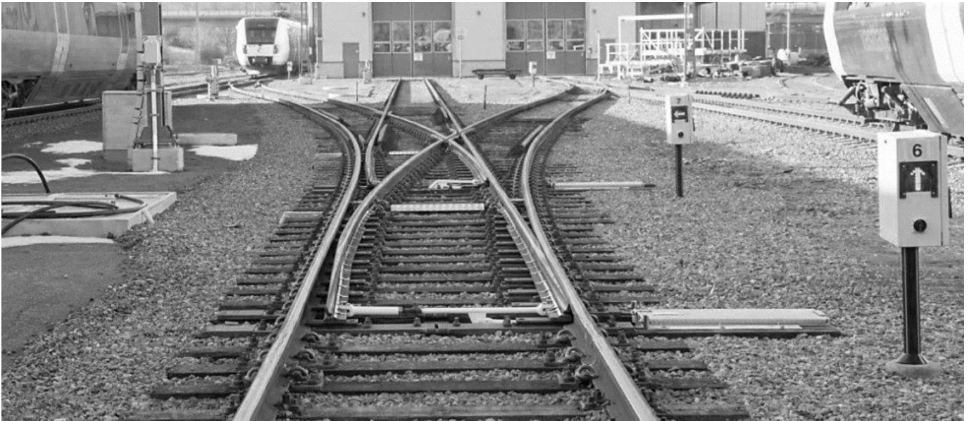
3-way turnout in Solna (Stockholm)