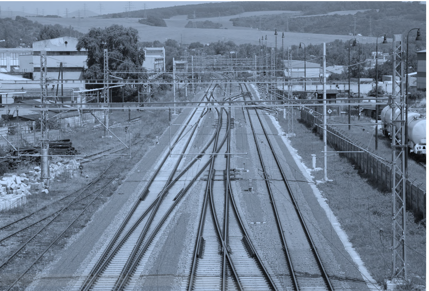
Nové Mesto nad Váhom