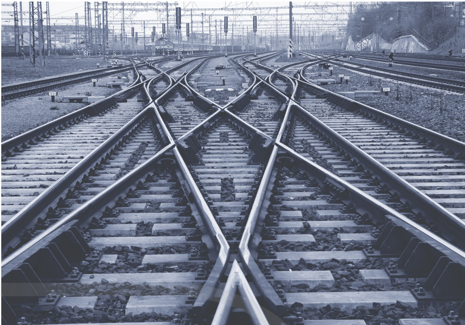
Prague - Libeň