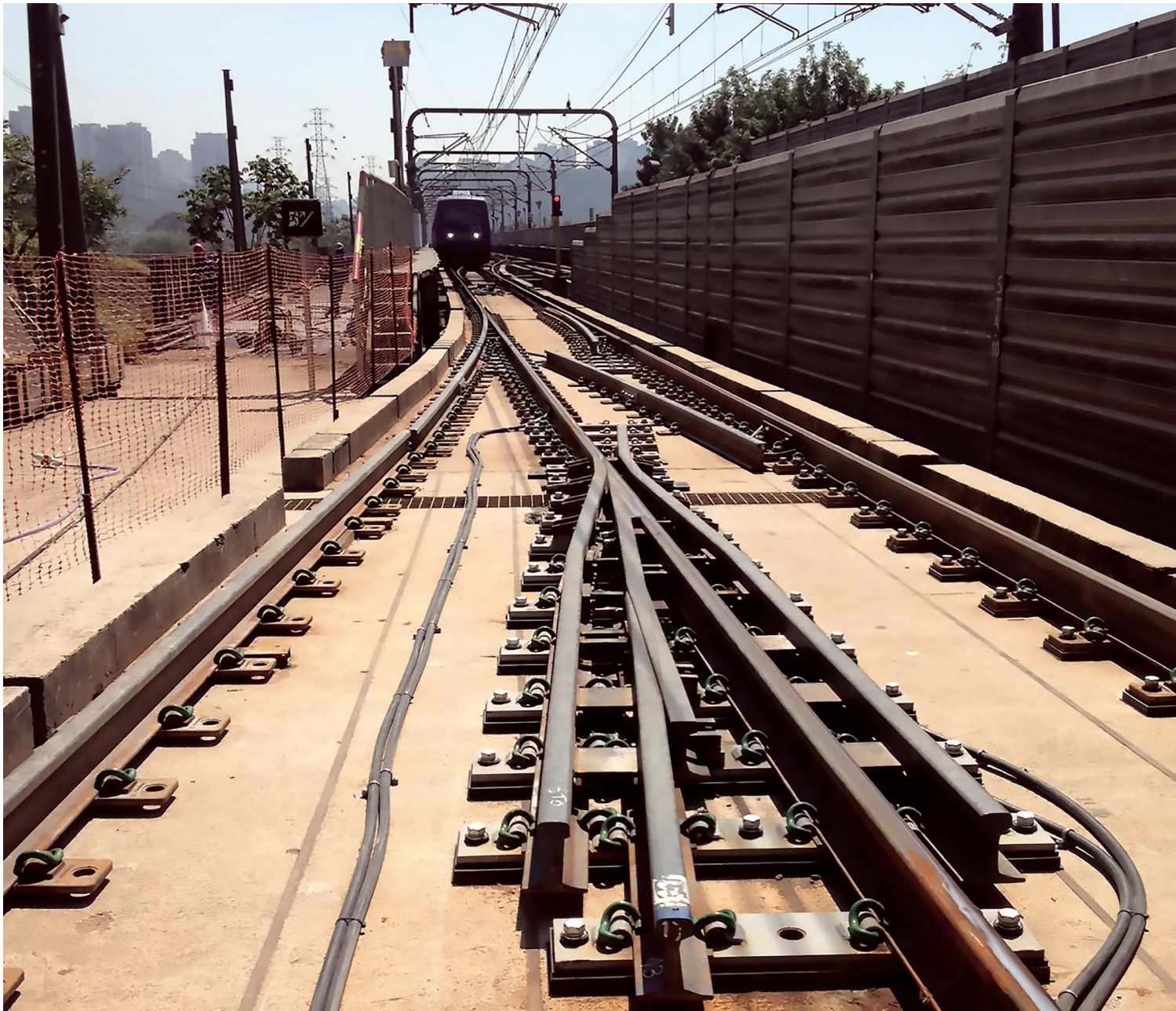
Metro São Paulo, Line 5