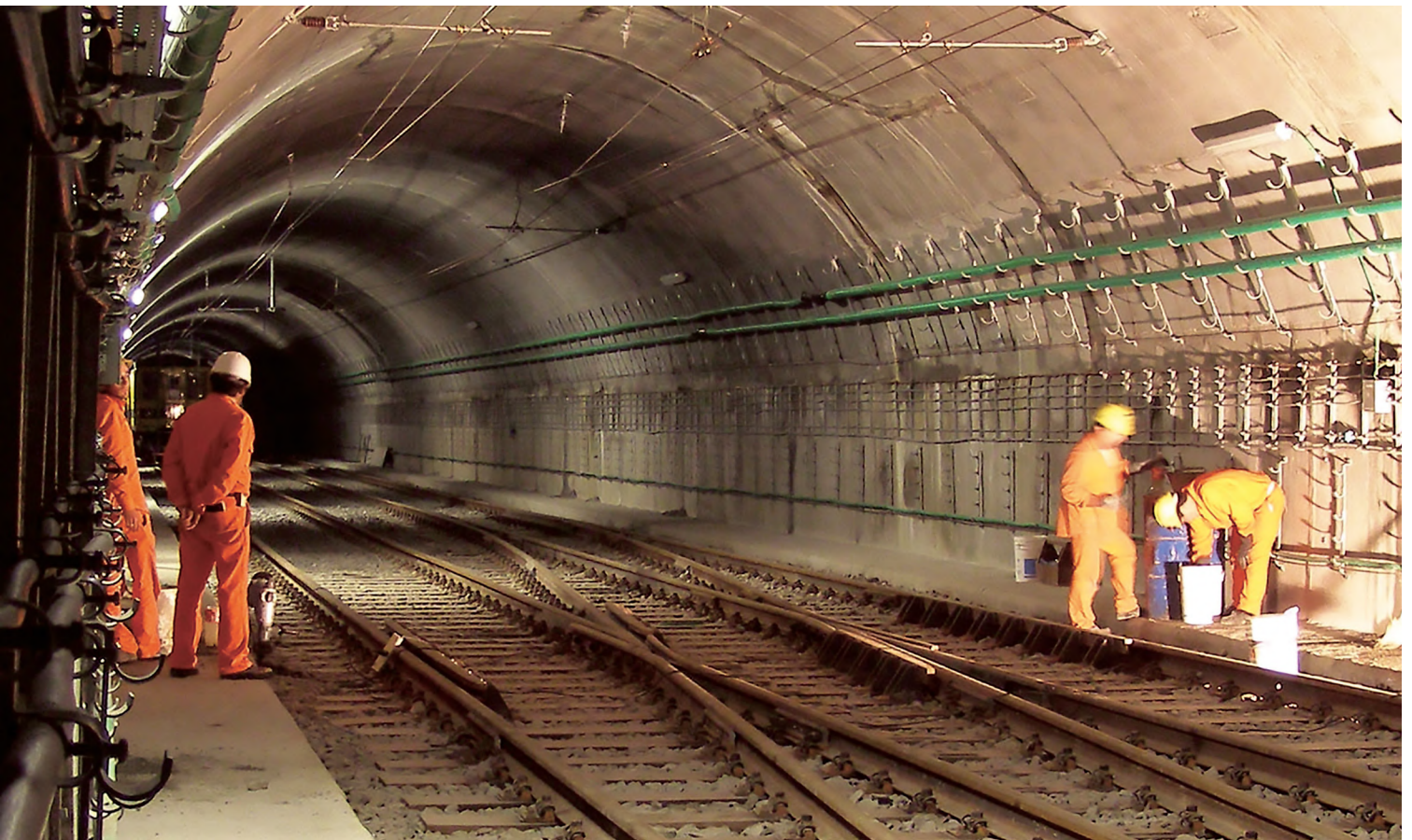
Metro Buenos Aires, Line H